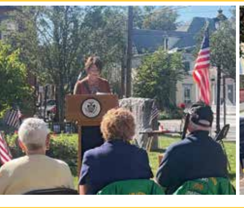
National POW/MIA Recognition Day