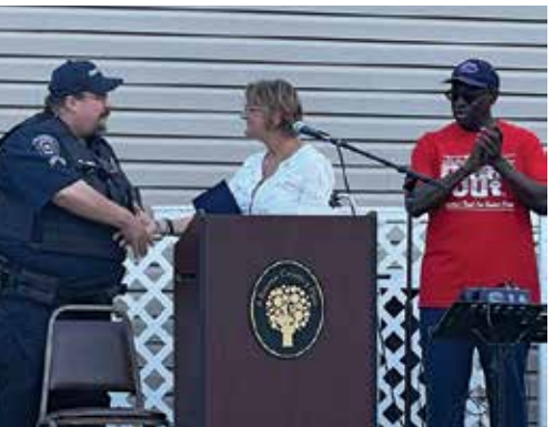
National Night Out